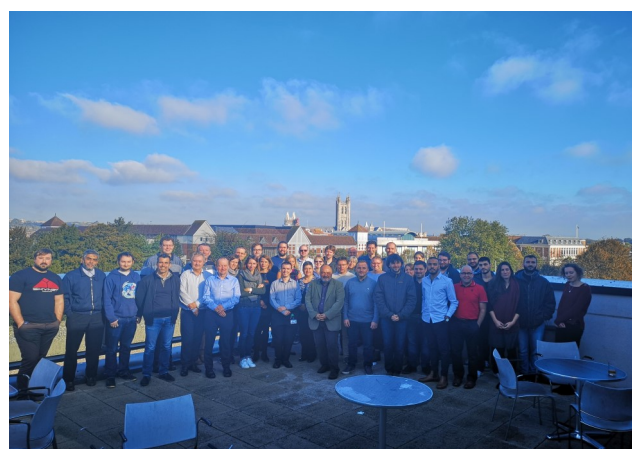
ADAPT Steering Group meeting, October 2018