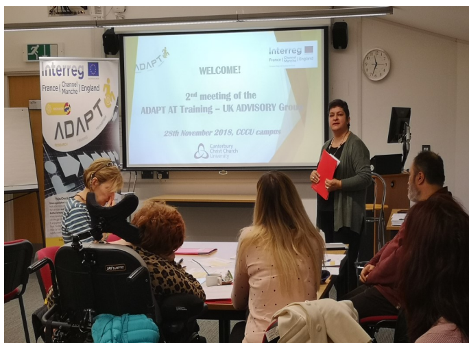
ADAPT 2nd UK Advisory Group meeting, November 2018

Since Spring 2018, the CCCU team has been working on the development of online AT training for Health Care Professionals (HCPs). Further to an initial workshop with UK and French partners, hosted in Canterbury in March 2018, a number of cross-border meetings have taken place with project experts to develop the initial 'Foundations of AT' Unit. This Unit will be formally launched in April 2019.