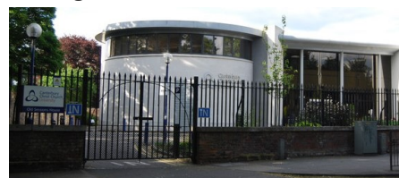
Old Sessions House, Longport CT1 1PL

Assistant Lecturer in Medieval and Early Modern History, Centre for Kent History and Heritage, School of Humanities, Canterbury Christ Church University, North Holmes Road, Canterbury