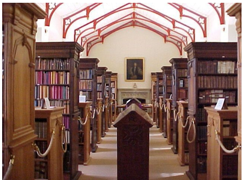
Canterbury Cathedral Library