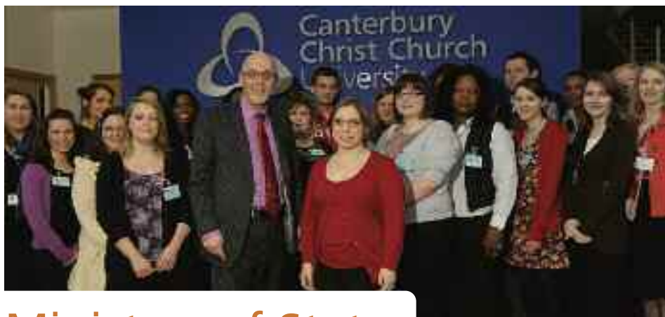
Education Minister visits Broadstairs