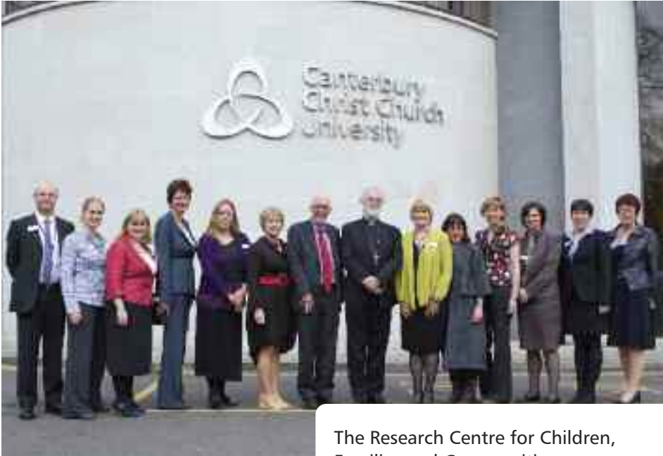
Archbishop of Canterbury opens Research Centre